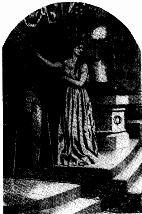
These cartoons by Thomas Nast mirror the revival of racism in the North. Above, "And Not This Man?" from Harper's Weekly , August 5, 1865, provides evidence of Nast's idealism in the early days after the Civil War. Nine years later, as Reconstruction was beginning to wind down, Nast's images of African Americans reflected the increasing racism of the times. Opposite is "Colored Rule in a Reconstructed (?) State," from the same journal, March 14, 1874. Such idiotic legislators could obviously be discounted as the white North contemplated giving up on black civil rights.

Textbooks need to offer the sociological definition of segregation: a system of racial etiquette that keeps the oppressed group separate from the oppressor when both are doing equal tasks, like learning the multiplication tables, but allows intimate closeness when the tasks are hierarchical, like cooking or cleaning for white employers. The rationale of