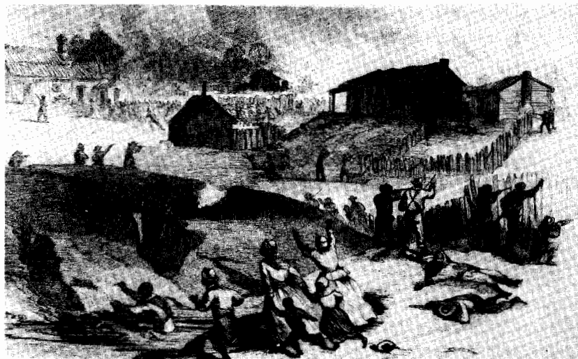
This illustration of armed whites raiding a black neighborhood in Memphis, Tennessee, in the 1866 riot, exemplifies white-black violence during and after Reconstruction. Forty African Americans died in this riot; whites burned down every black school and church in the city.

South Carolina, black people there were left helpless and destitute.” In reality, these black people enlisted in Union armies, operated the plantations themselves, and made raids into the interior to free slaves on mainland plantations. The archetype of African Americans as dependent on others begins here, in textbook treatments of Reconstruction. It continues to the present, when many white Americans believe blacks work less than whites, even though census data show they work more. 63