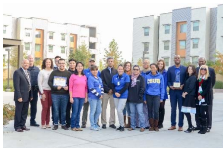
Housing and Residence Life

The Campus Beautification Committee is proud to recognize members of our campus community each month for their outstanding contributions toward keeping CSUB beautiful. Congratulations to November's winner, Housing & Residence Life for their adopted area, Student Housing East, and to January's winner, Counseling Services for their adopted area, the Counseling Center. If you are interested in adopting an area or would like to learn more about the Campus Beautification Committee, please visit http://www.csub.edu/about_csub/beautify/ .