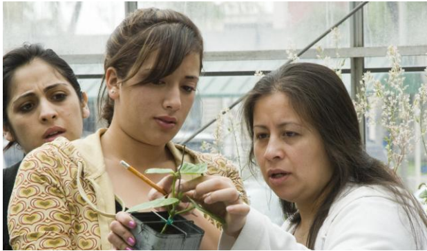
California State University, Los Angeles

37% of FY students at least occasionally spent time with faculty members on activities other than coursework.