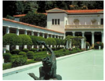
Outer Peristyle, The J. Paul Getty Museum at the Getty Villa