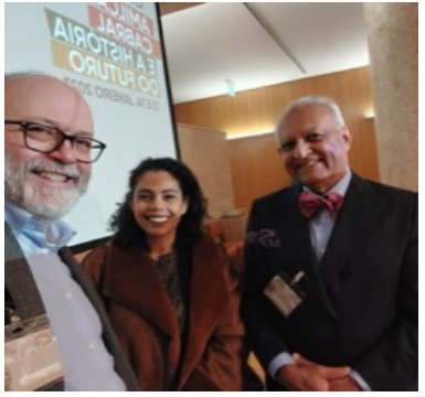
At the Portuguese Assembly of the National Republic