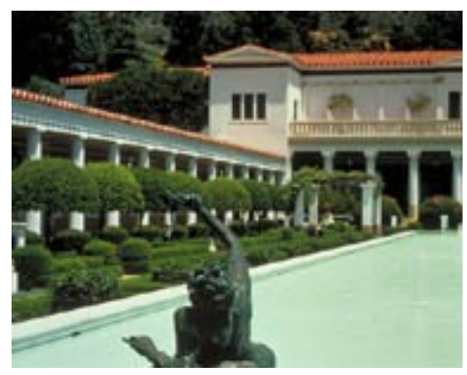
Outer Peristyle, The J. Paul Getty Museum at the Getty Villa

And did I mention that both are FREE ?! All you have to do is go online in advance to reserve parking for the day/time of your visit. The parking fee is $20 per car, which is quite a bargain to see either of these museums. Each is also open six days a week, aside from major holidays. (The Center is closed on Mondays, and the Villa is closed on Tuesdays.) Weekends can be especially busy, so plan your visit in advance.