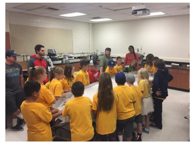
Geology students and faculty showing a group of elementary school students our new stream table purchased from community donations and used in classes and outreach activities.

Apologies if we forgot someone, let us know so we can acknowledge you in next year's newsletter.