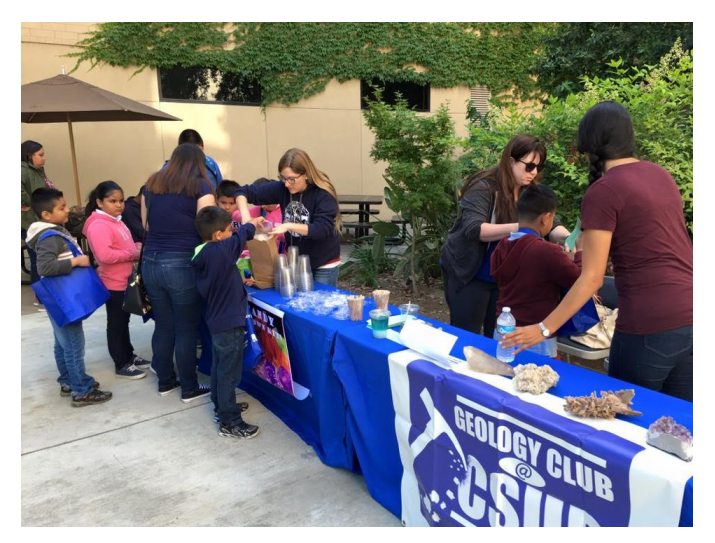
One of the many outreach activities of the CSUB Geology Club.

Physical Geology students after successfully mapping the Skyline Tuff and a fault in Rainbow Basin.