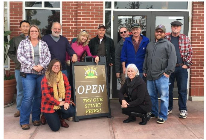
Most of the department faculty, emeritus faculty, and staff in Fall 2016.