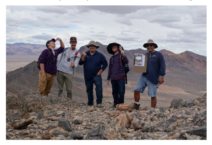
On the Introduction the Field Methods trip

Last semester the Physical Geology class included a 3-day field trip to Zzyxx where students learned about geological processes around the Mojave National Preserve, Kern Canyon, and Rainbow Basin areas. We had about 70 people total on the trip, including Geology Club members and people from the community. Everyone had fun while learning!