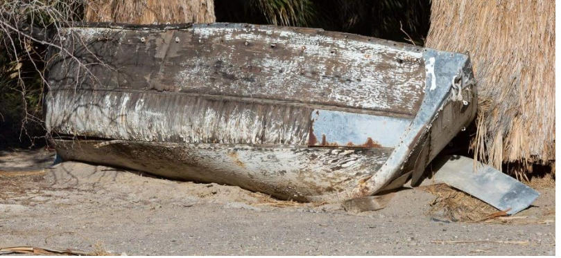
We hear stories around the boat by the pond at Zzyzx from early CSUB Geology field trips. Maybe someone wants to share them for future newsletter?