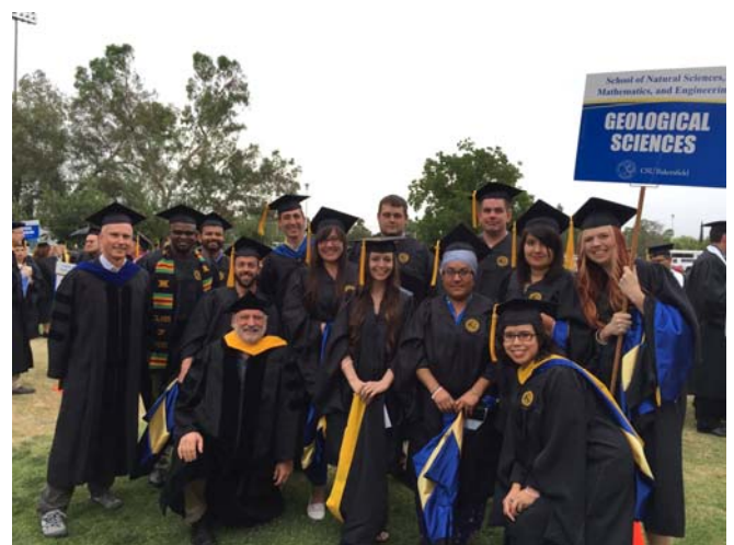
At the 2015 Graduate Commencement