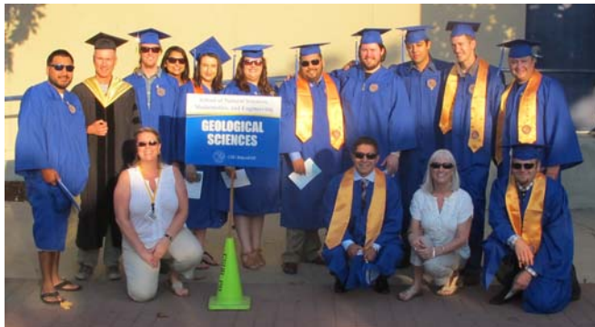
Some Geo grads at Spring 2015 Commencement.

It is always fun to look back and realize that in a year that just seemed like a blur of classes, meetings, and reports, a lot got accomplished after all. Enrolment in our programs continues to grow and a record 23 undergraduate and 14 graduate students received their degrees in 2015.