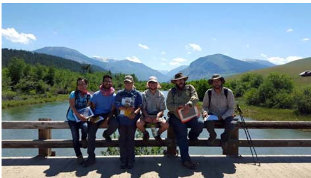
CSUB Students enjoying a quiet moment during field camp in Montana. Almost all students are supported for their capstone experience through scholarships from the CE Strange Endowment and donations added to it over the years.

Nothing will make Rob Negrini happier than to see more alumni donating to the Department this year. Please, please, please, step up to the plate and give generously. Your tax-deductible donations will be spent responsibly on student-supported causes like defraying the cost of summer field camp, student travel to meetings, etc.