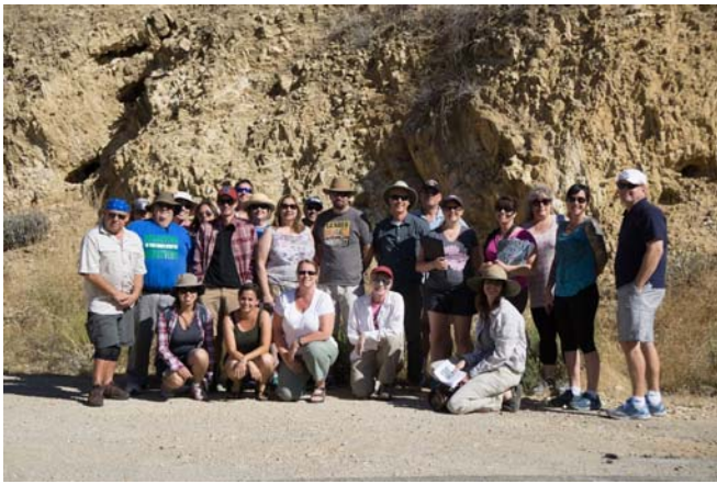
A group of high school teachers from throughout California learning about San Joaquin Valley geology and teaching honors geology classes.

In addition to our work with students, the department is meaningfully engaged in the local and our profession communities. We hosted the Fall 2015 Field Conference of the Far Western Section of the National Association of Geoscience Teachers, as well as teacher workshops in Bakersfield and at the California Science Teachers Association meeting in Sacramento.