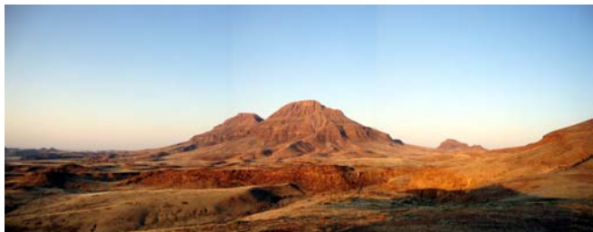
Just another day in the field in Namibia.