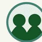
Older Brothers or Sisters