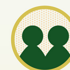
Aunts or Uncles

If you're not sure whom to report as a parent, you can visit StudentAid.ed.gov/fafsa/filling-out/parent-info or call 800-4-FED-AID (800-433-3243).