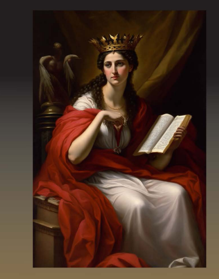
California State University, Bakersfield Department of English