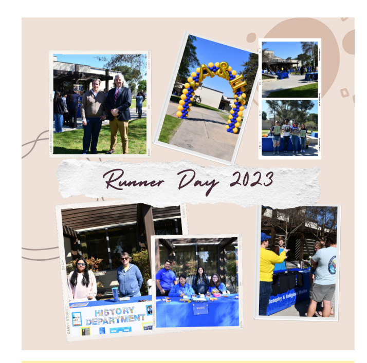
2023 CSUB Runner Day welcomed students and family members to CSUB and introduced them to the academic opportunities in the School of Arts and Humanities.