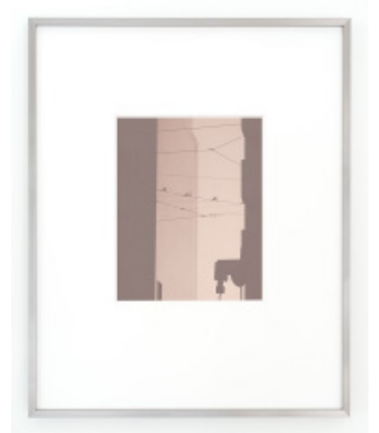
Street Unfixed silver gelatin print 2021