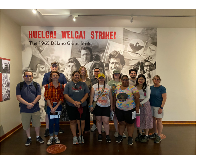
History Department Field Trip

The issue can be accessed through the English Homepage.