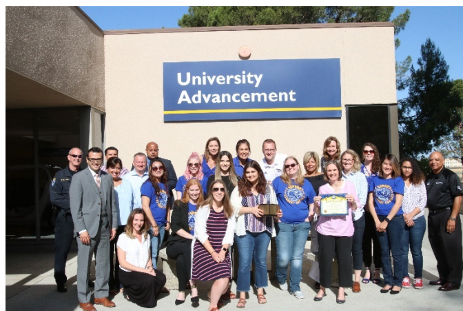
University Advancement, April and May winners

our May winner, University Advancement , for their adopted area. University Advancement also won in April. We also congratulate General Accounting , our March winner. We are proud to recognize members of our campus community each month for their outstanding contributions toward keeping CSUB beautiful. If you are interested in adopting an area or learning more about the Campus Beautification Committee, visit http://www.csub.edu/about_csub/beautify/ .