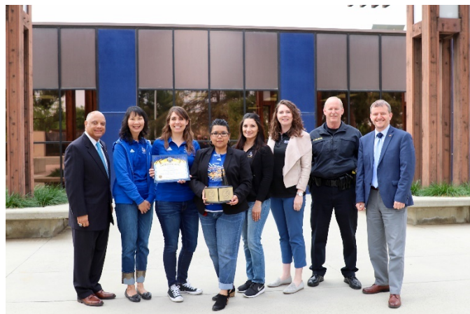
General Accounting, March winner