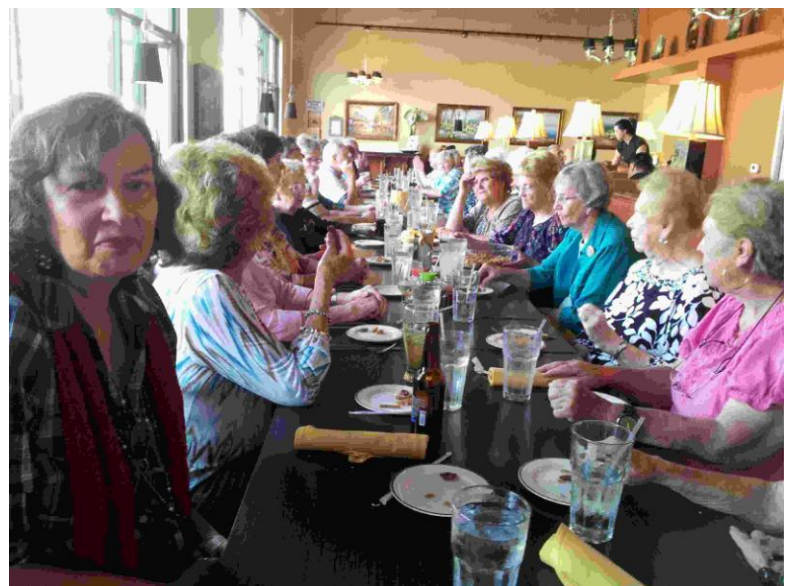
Diner's Lunch at Thai Orchid, November 8