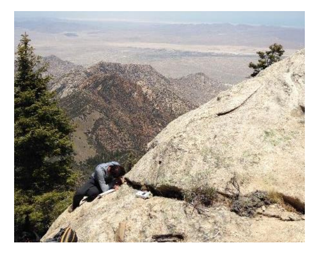
Daniel surveying plants growing at a cliff's edge.