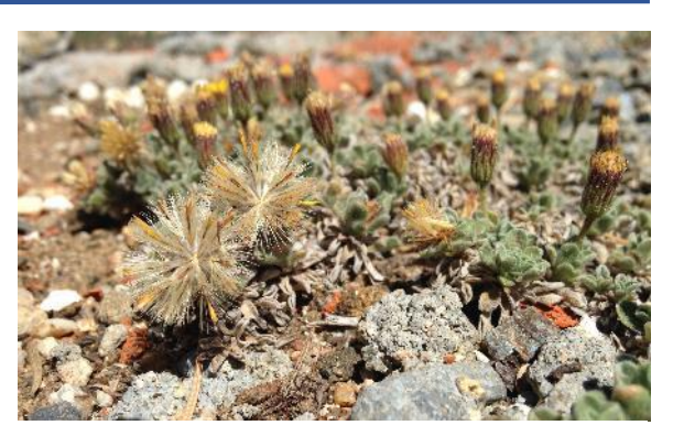
Heterotheca brandegeei setting seed.

Their study examined the interactive effects of increased warming and drought on this rare cushion plant, and you can find the results of their work in Conservation Physiology: <u>Early life history responses and</u> <u>phenotypic shifts in a rare endemic plant</u> <u>responding to climate change</u>.