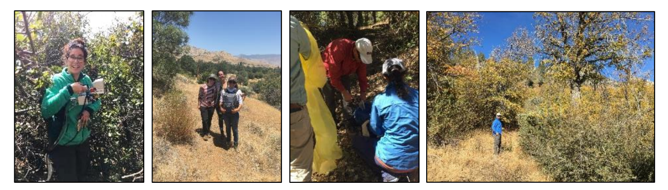
Figure 2. Sampling oak species in the southern Sierra.

to visualize the damage that occurs in the vascular system in response to drought. I used this new technology in combination with more traditional methods to address my research questions about how plants may or may not be equipped to respond to water stress. Using multiple methodologies to examine various parameters allowed for us to learn about plant xylem structure, as well as compile a more robust data set that