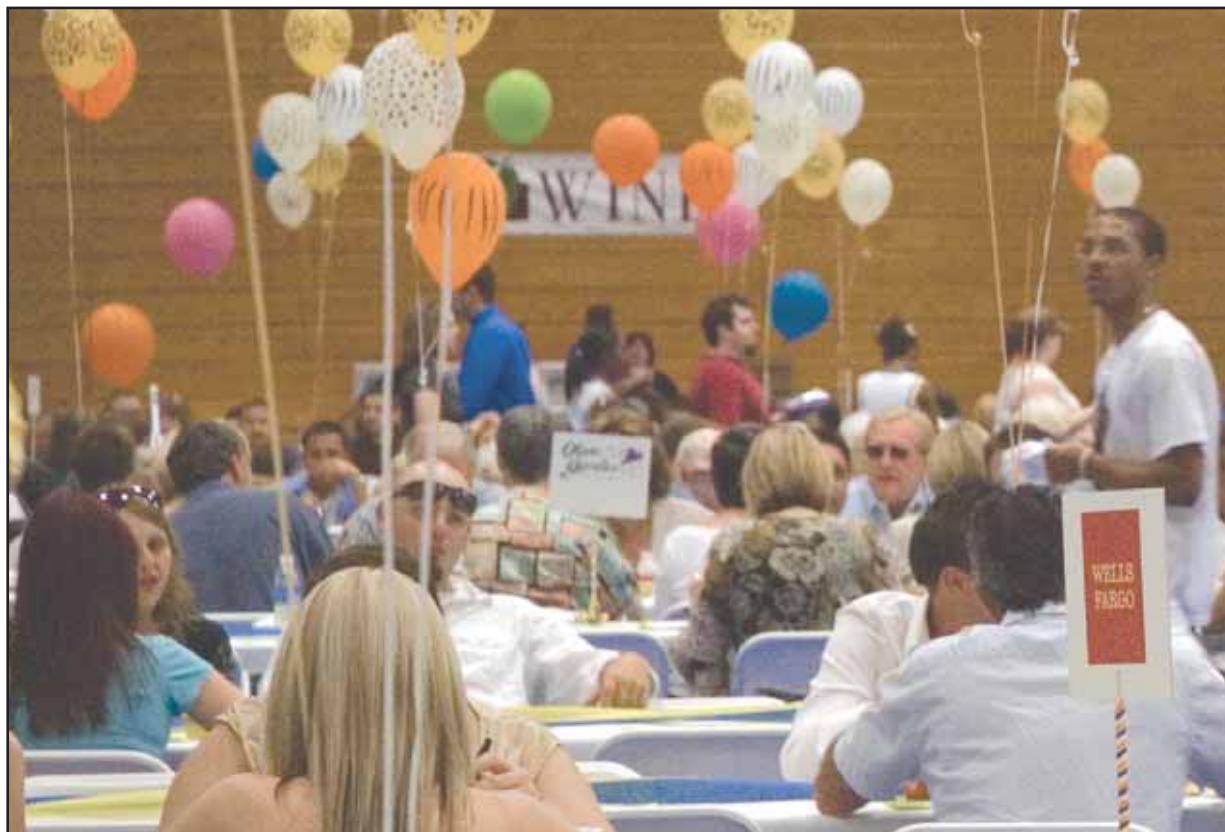
Patrons enjoying food and beverages at the the Spring Barbecue.

In addition to the booze and food, many businesses and organizations around town were on hand to give away free pro-