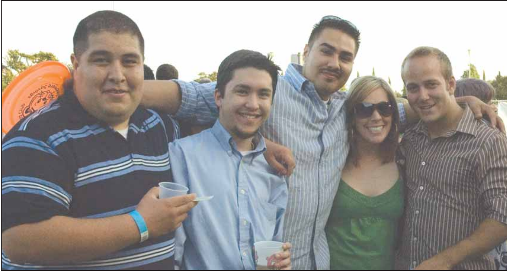
Students enjoying the festivities at the 36th annual Spring Barbecue.