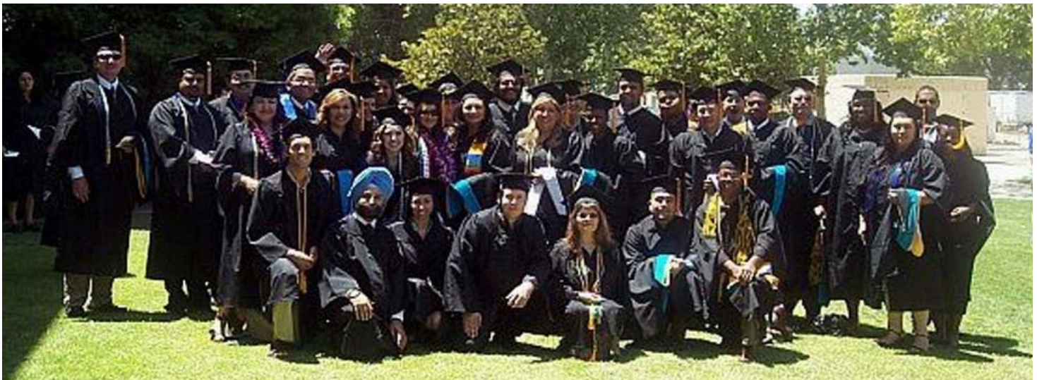
The “Class of 2006-2007,” included “29” MPA and “9” MSA-HCM graduates.