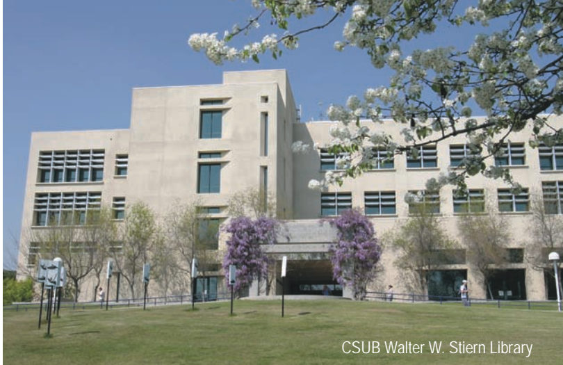
CSUB Walter W. Stiern Library