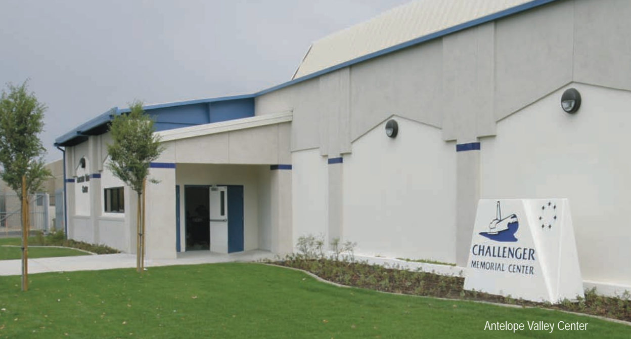
Antelope Valley Center