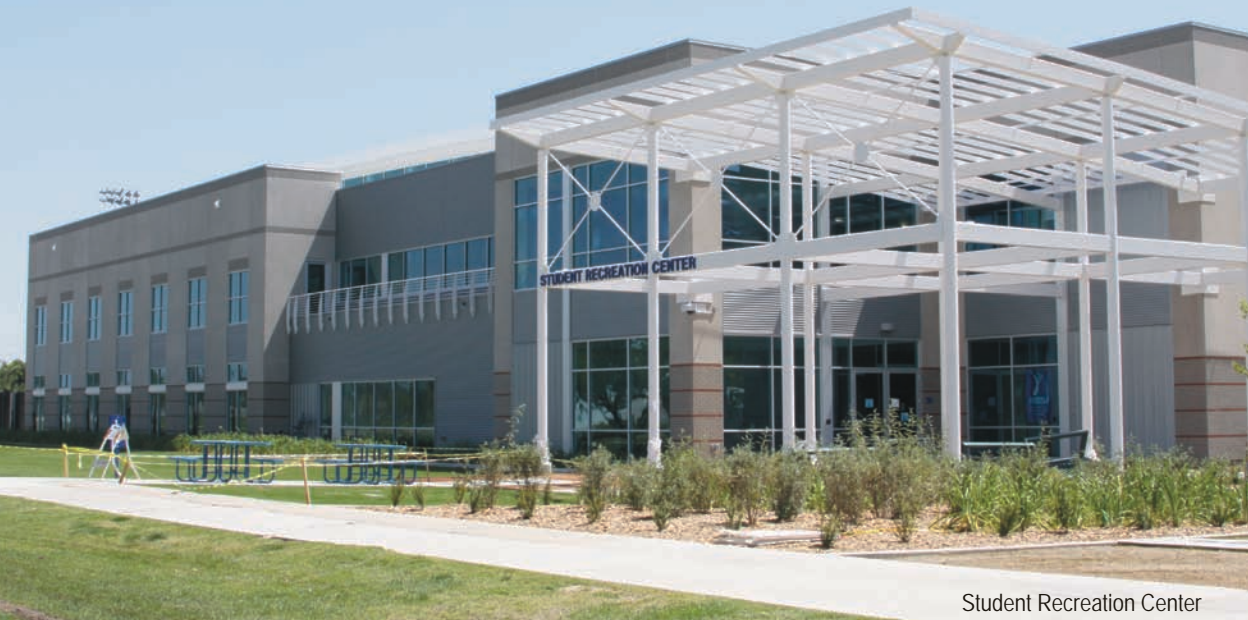
Student Recreation Center