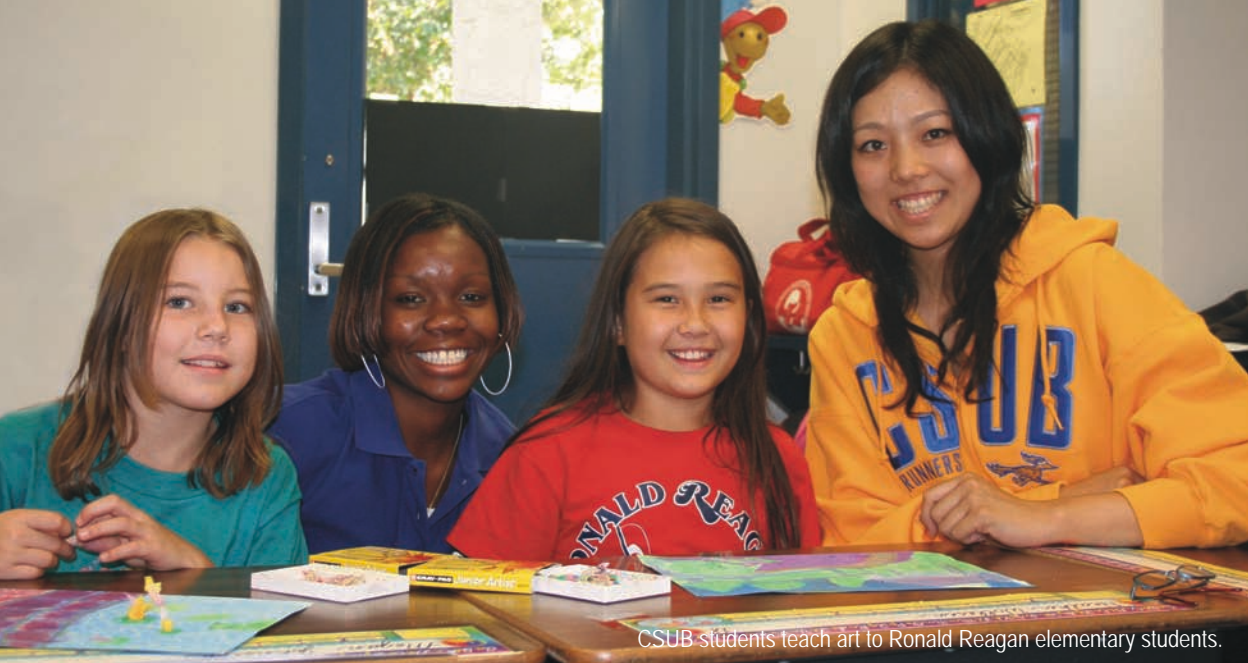
CSUB students teach art to Ronald Reagan elementary students.