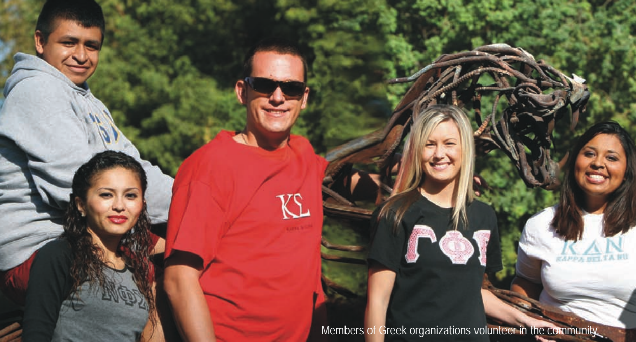
Members of Greek organizations volunteer in the community.