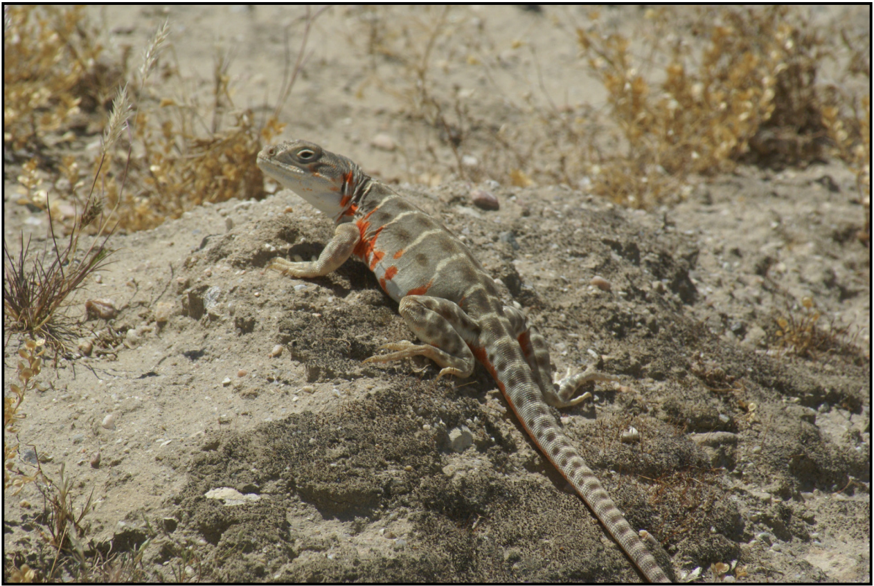
FIGURE 1. Female Blunt-nosed Leopard Lizards ( Gambelia sila) from the Lokern Natural Area of the San Joaquin Desert, California.

fragmented and limited to southern Merced County south to Kern, San Luis Obispo, and northern-most Santa Barbara and Ventura counties (USFWS 1998, 2010).