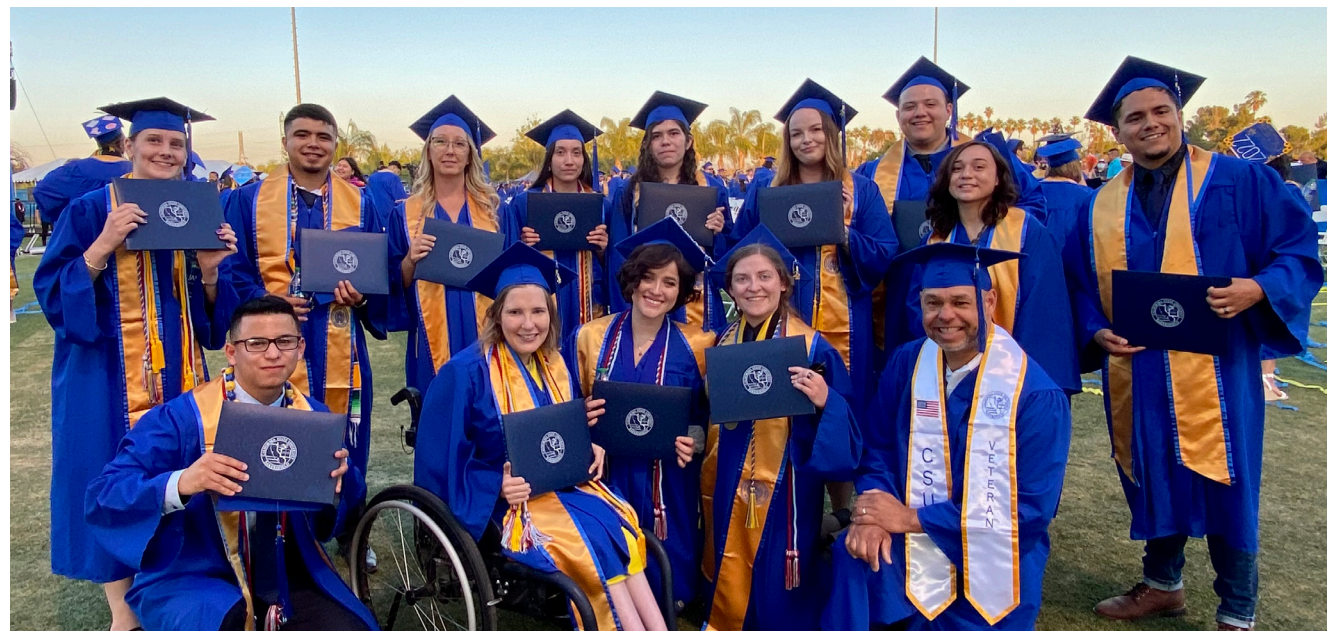
History Class of 2022!