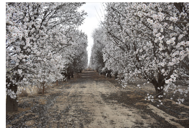
Untitled (2022) Humberto Plascencia