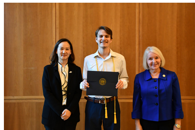
WILLIAM IRWIN Outstanding Performing Arts Project