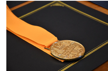
MELISSA PETTIT Interdisciplinary Studies