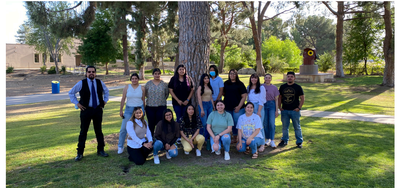
Spanish Class of 2022!